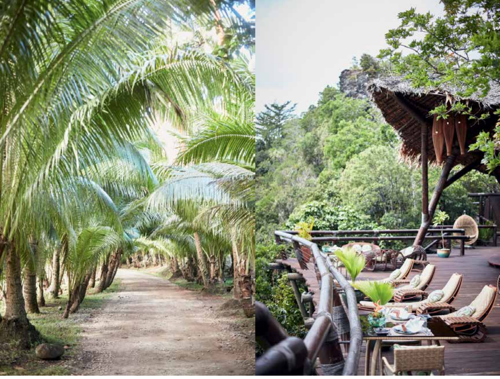
Clockwise from top left: Laucala resort's shaded pathways, lush terrace, guest boat, family villa and traditional musicians striking up a tune