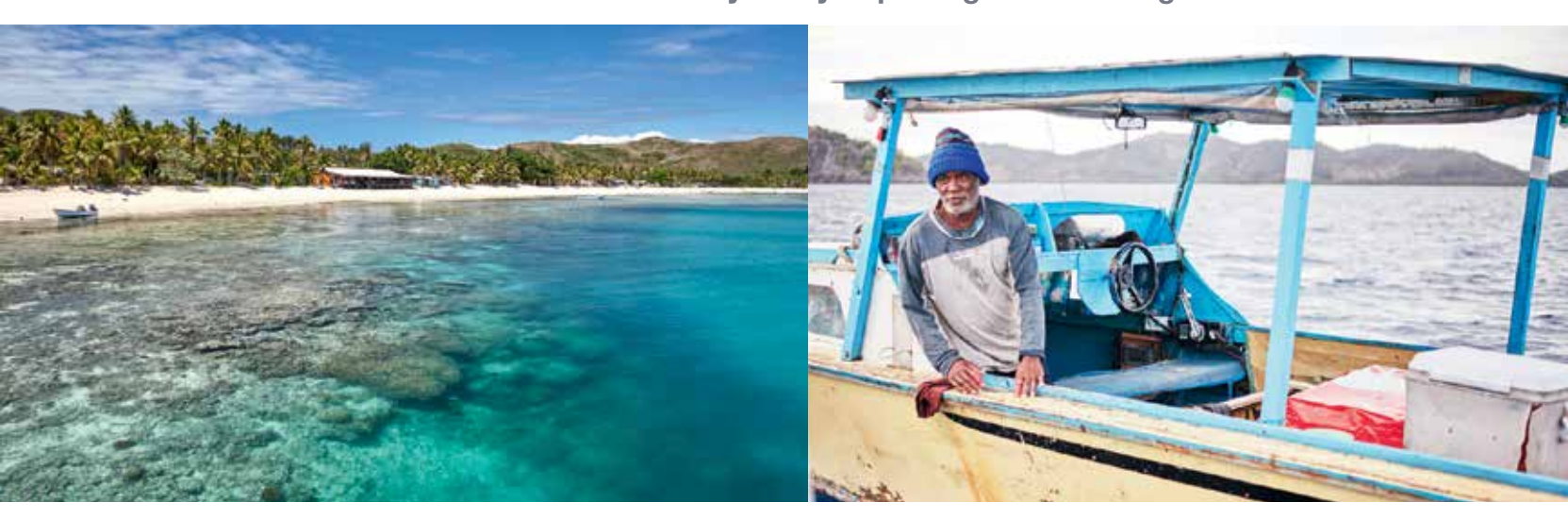
onto Laucala Island, he feels that the essence of the place is to use what's around him'