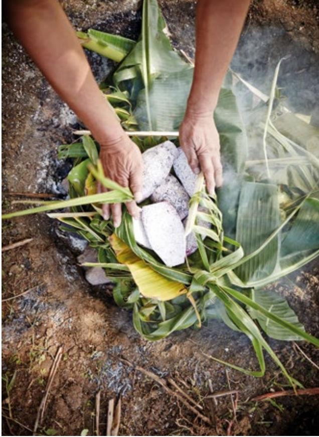
From left: There is one single road that rings around Rarotonga so it's very hard to get lost; Preparing the umu (earth oven feast) with banana leaves to dampen down the hot coals; Hermit crabs outnumber the chickens on Rarotonga and are much easier to catch.