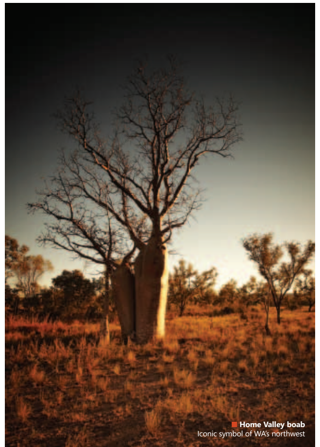
■ Home Valley boab Iconic symbol of WA's northwest

While iconic destinations are essential for a journey such as this,