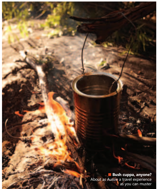
■ Bush cuppa, anyone? About as Aussie a travel experience as you can muster

Ross shares more than the scenery though, and we make a visit to the family woolsheds. Magnificent timber floors are coated with a century of lanolin, fresh off the sheep’s back. While the wool is growing in the paddocks, the sheds lie empty and still, so we rummage through the calm in search of light and composition. Ross is a photogenic fellow himself and with a little encouragement we get some portrait poses set against the shearing runs.