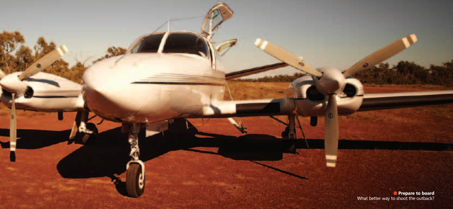
■ Prepare to board What better way to shoot the outback?

“A more diverse collection of inspiration is hard to imagine, packed into a very intense two-week schedule”