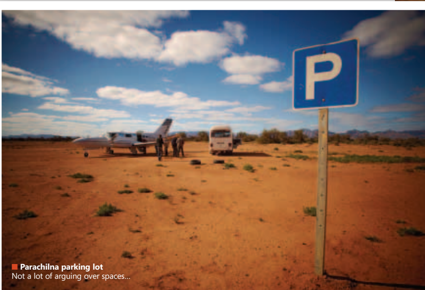
■ Parachilna parking lot Not a lot of arguing over spaces...