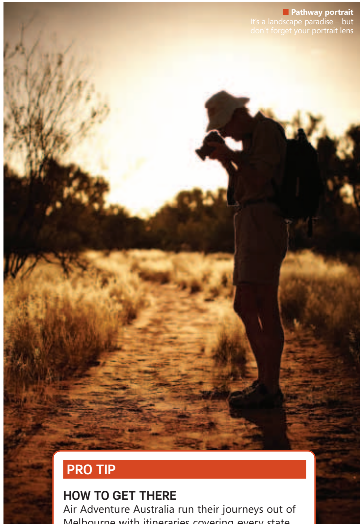
■ Pathway portrait It's a landscape paradise – but don't forget your portrait lens