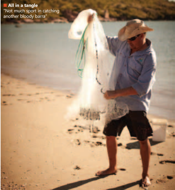
■ All in a tangle "Not much sport in catching another bloody barra"

PRO TIP WHAT'S IN THE BAG? Such a diverse journey offers opportunity for landscapes, sunrise, wildlife and portraits. You have to pack everything from a 16mm wide angle to a 400mm telephoto. This is where DSLR technology really excels. I saved a little weight in my luggage by leaving the swimming togs at home – there are too many crocs along the Kimberley coast for a casual swim anyhow.