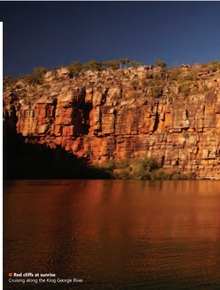
■ Red cliffs at sunrise Cruising along the King George River

Air Adventure Australia run their journeys out of Melbourne with itineraries covering every state in the country. I liked the outback flying tour so much I decided to go back and run a flying photographic workshop with them in June 2012. airadventure.com.au