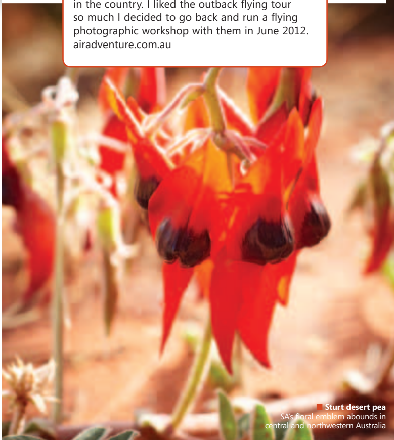
■ Sturt desert pea SA's floral emblem abounds in central and northwestern Australia

With the light of dusk disappearing behind the horizon, I got myself a shot of Ross with a fishing rod in hand. I knew he'd rather be posed next