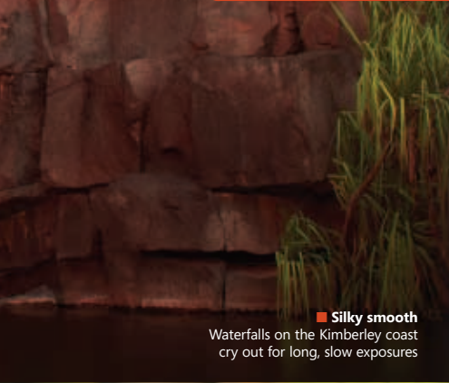
■ Silky smooth Waterfalls on the Kimberley coast cry out for long, slow exposures