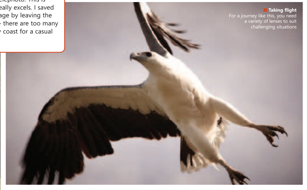
■ Taking flight For a journey like this, you need a variety of lenses to suit challenging situations