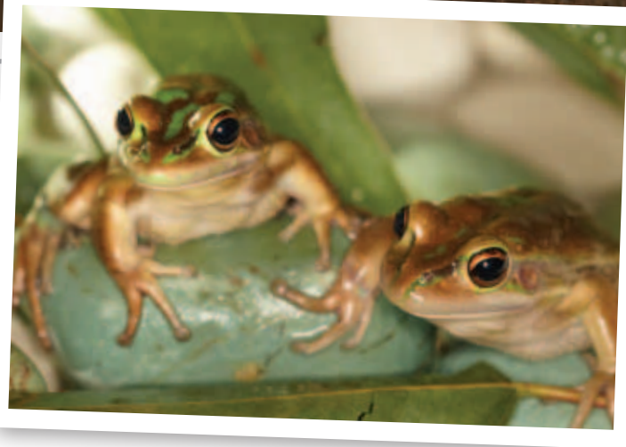
Cheer up, fellas. It's almost over...