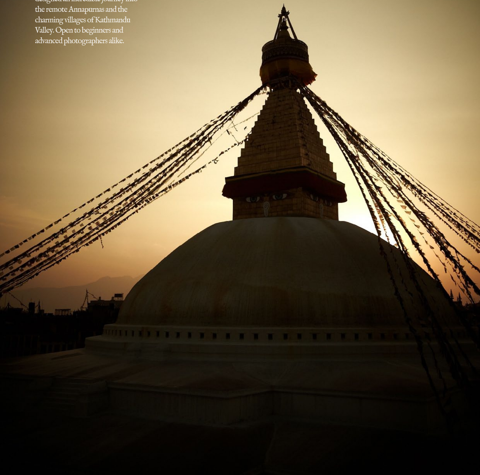
Photo tours designed by photographers, for photographers. Advance your photographic skills while travelling through Nepal on a 15 day adventure. We have designed an incredible journey into the remote Annapurnas and the charming villages of Kathmandu Valley. Open to beginners and advanced photographers alike.