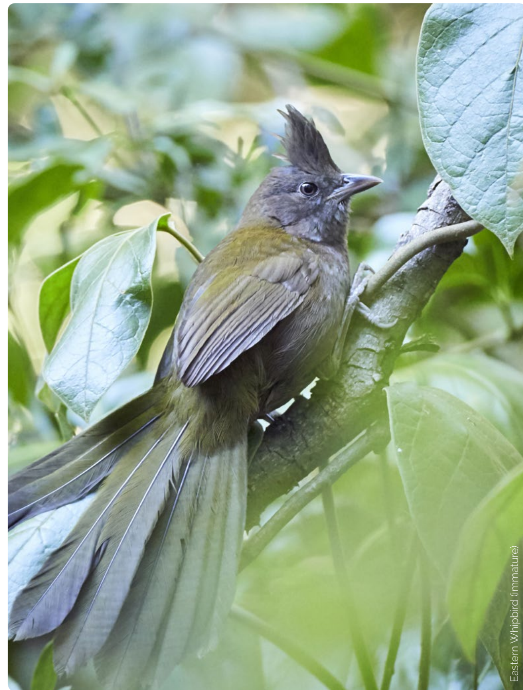
Eastern Whipbird (immature)

Once we leave the rainforest of Lamington National Park we will have a lot more sunlight to work with, unless shooting at the edges of the day. Having the skill to know when light is in short supply and respond to it will ensure you are prepared for a wide range of future situations.