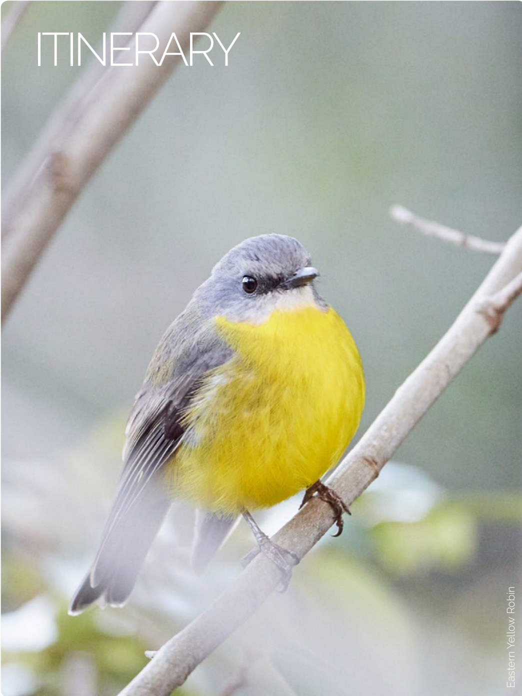
Eastern Yellow Robin