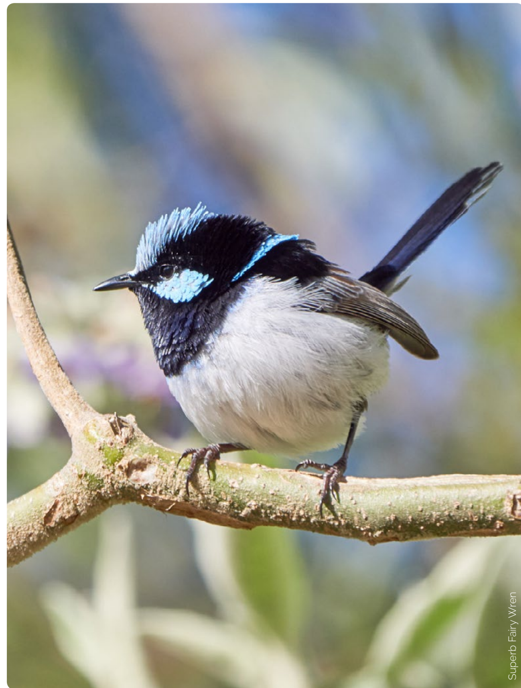
Superb Fairy Wren

Do bring your laptop and your preferred processing software. We will have dedicated sessions during the workshop to discuss different techniques, with a view to helping you better achieve the results and style you desire.