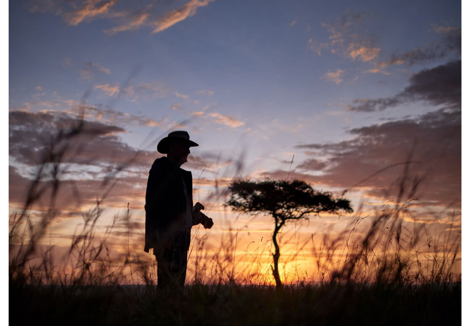
Sunrise on th Savannah