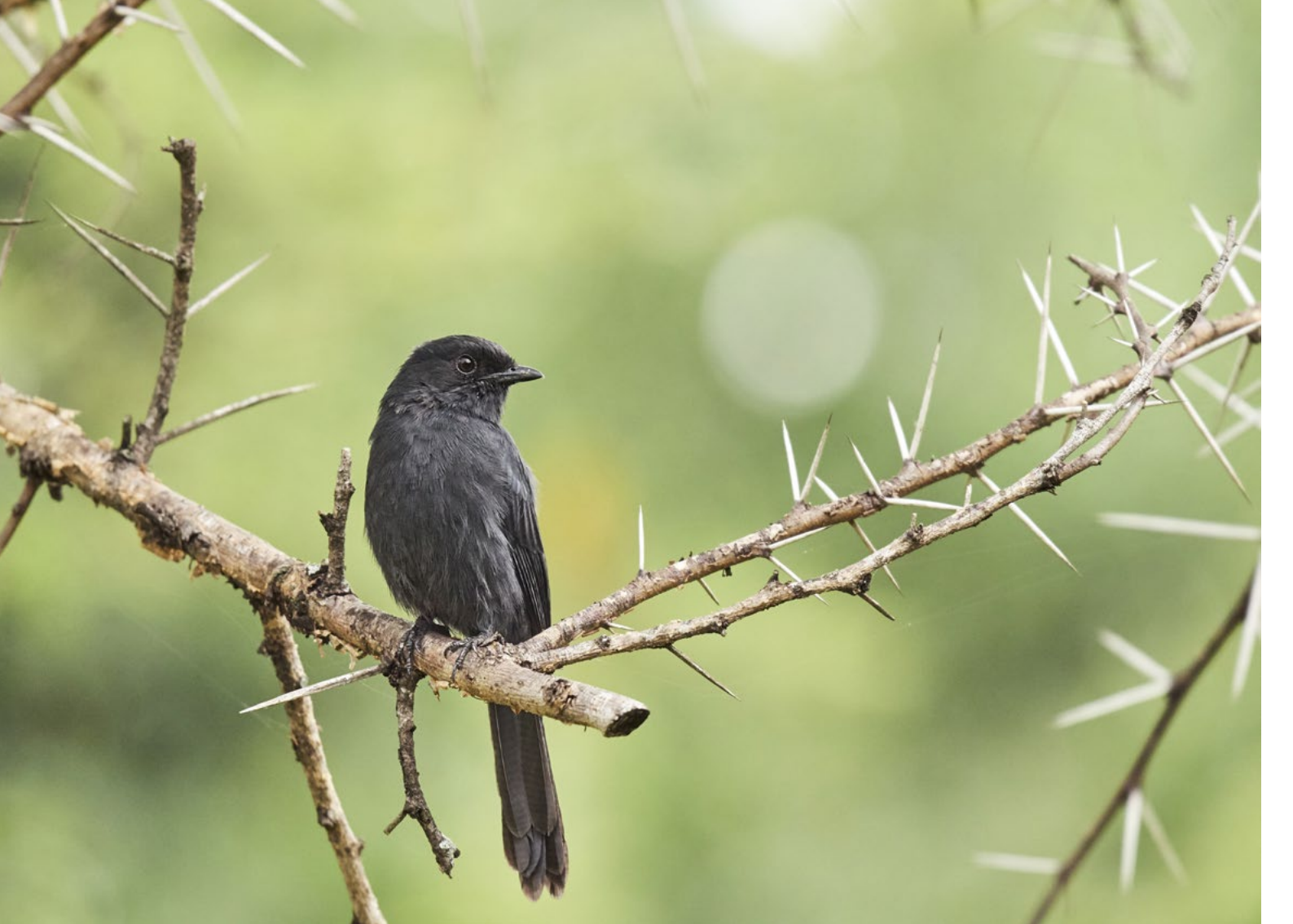
Northern Black Flycatcher